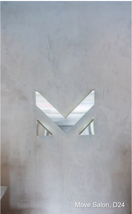
Move Salon, D24