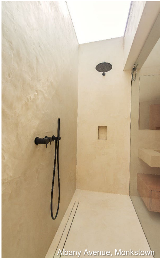
Albany Avenue, Monkstown