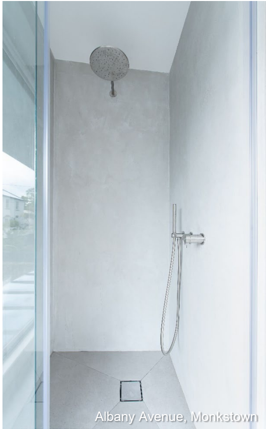
Albany Avenue, Monkstown