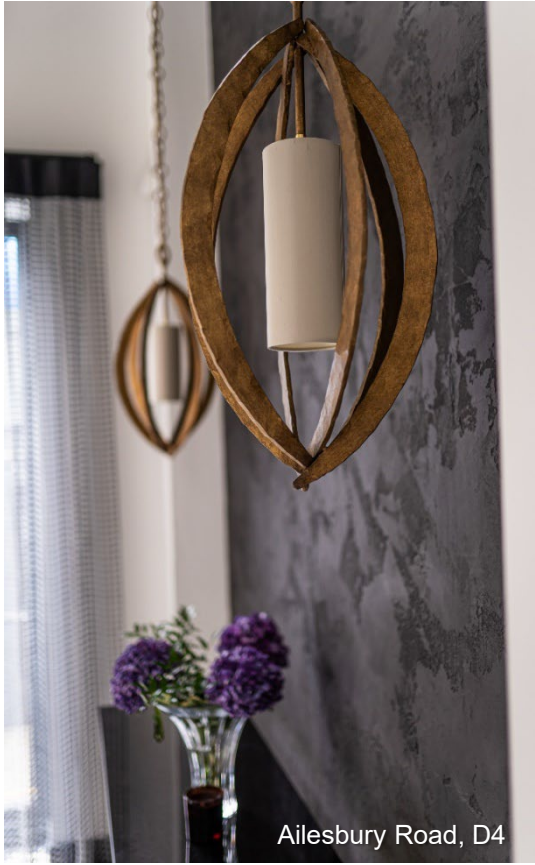
Ailesbury Road, D4